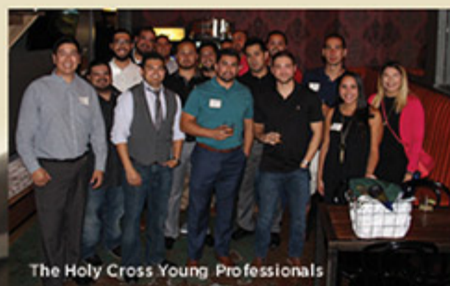
The Holy Cross Young Professionals

LET US CONTINUE TO SUPPORT THE LIGHT IN THE WESTSIDE!